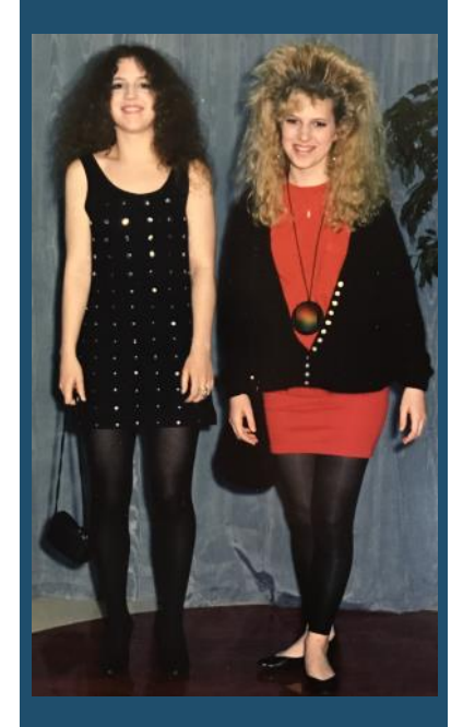
She required I shrink the photo down to be able to use it. Email me for a full-size copy. Thanks!