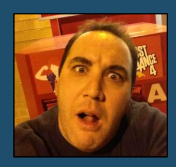
Renting a Zombie movie at the Redbox.

Helping you, your friends and family... buy, sell, and invest in Colorado.