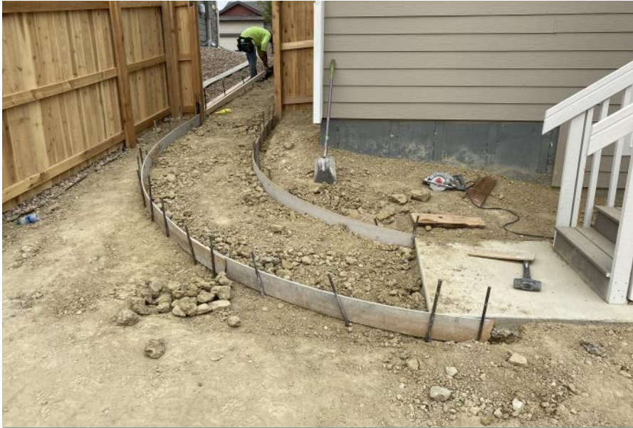
Preparing for the concrete path to be poured from the front of The Hermitage to the back.