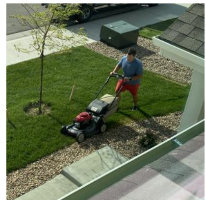
Royce offers (an apparently complimentary) lawn mowing service for new neighbors.